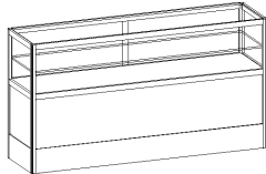
HALF VISION SHOWCASE