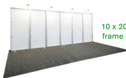
10 x 20 ft. frame