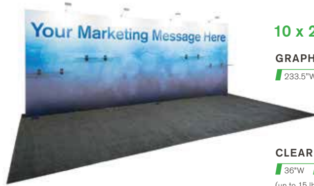
10 x 20 ft. unit