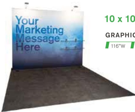
10 x 10 ft. unit

Renting exhibits can virtually eliminate your shipping footprint and carbon emissions. Using a Freeman rental exhibit includes 100% recyclable aluminum for the structure.