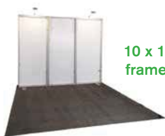
10 x 10 ft. frame

This option is available for customers who have previously rented the SmartFabric® Rental Exhibit and are reusing their back wall graphic. Fabric from other sources will not be installed on this Freeman frame rental. If you need Freeman to create a new graphic, please select the SmartFabric® Rental Exhibit. No fabric graphics will be provided separately from the rental unit.