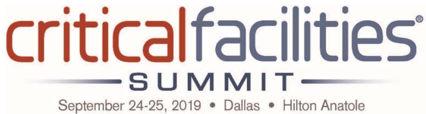
Exhibit Space & Display Regulations In-Line & Linear Exhibit Space